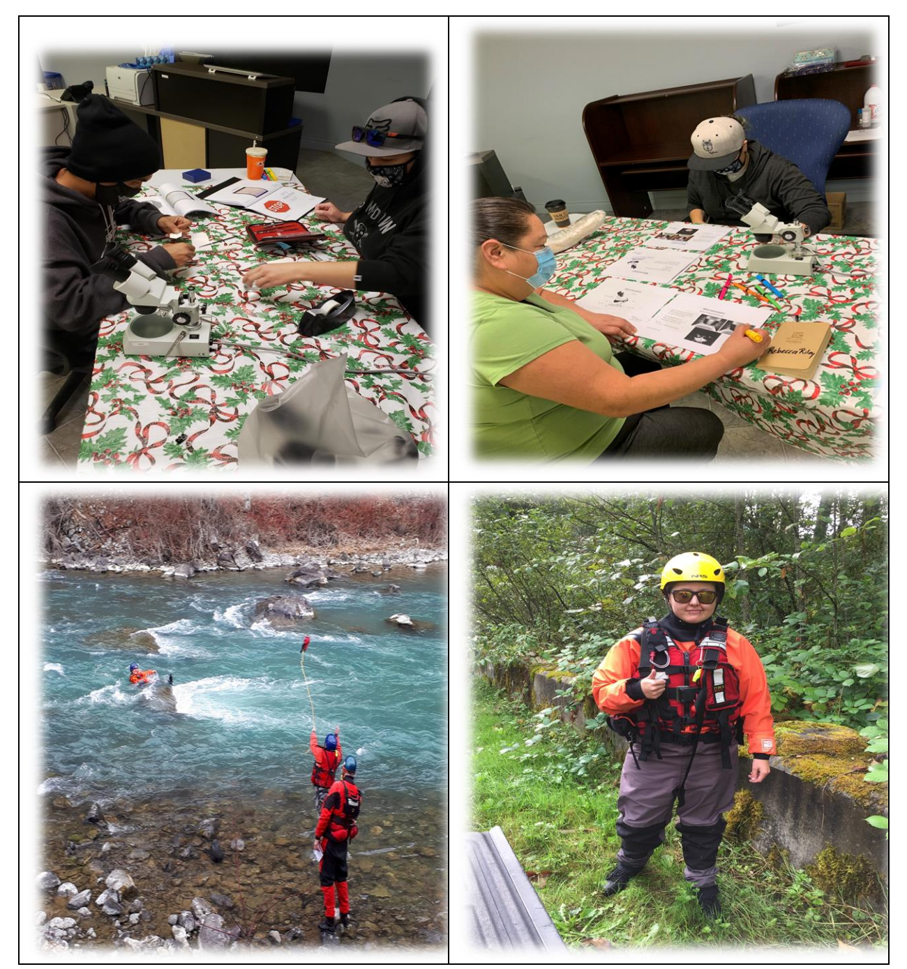
SWIFT WATER TRAINING AT SETON RIVER